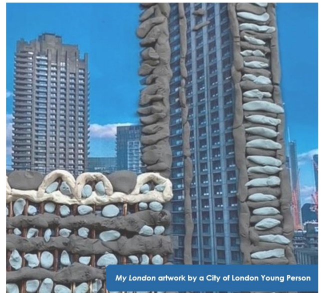
My London artwork by a City of London Young Person

If you would like the survey in a different format or would prefer to offer your views in person, with or without the help of an interpreter, please email EEYServices@cityoflondon.gov.uk